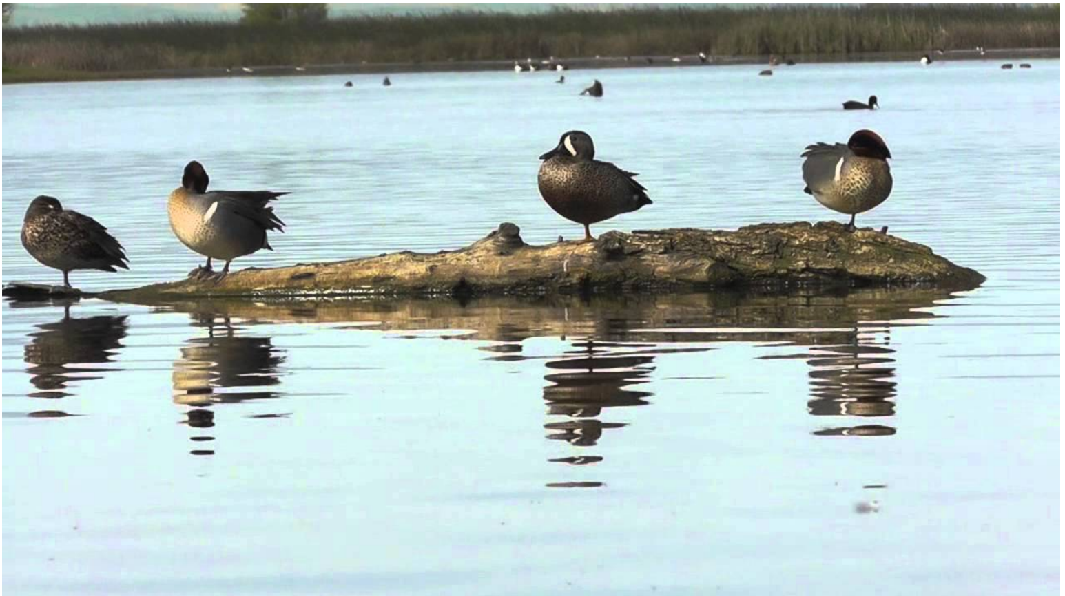
BLUE-WINGED TEAL PREENING AT SACRAMENTO NATIONAL WILDLIFE REFUGE

Coot, and Pied-billed Grebe. Some of our pond favorites, often heard but not seen, sounded off to be counted were the Common Gallinule, Sora, and Virginia Rail. Along the pond edges we saw California Quail, Great Egret, Great Blue Heron, Acorn, Downy, and Nuttall's Woodpecker, Northern Flicker, California Scrub-Jay, Marsh, Bewick's, and Northern House Wren, Song and Golden-crowned Sparrow, Northern Mockingbird, California and Spotted Towhee. Three premiere raptors we observed were the Bald Eagle, Northern Harrier, and Red-tailed Hawk. When we transitioned from the pond area to the Battle Creek riparian areas, we had a few surprises of Cedar Waxwing, Red-breasted Sapsucker, Red-shouldered Hawk, and Red-winged Blackbird. Our count totaled 54 species and by the end of the day, we shrugged off the cold and left the field with a sense of accomplishment.